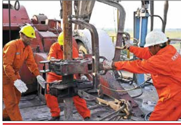
The absence of investment in exploration due to low oil prices in the past few years has been one big reason for global oil and gas production not keeping pace with demand globally

earns 65-66 paise in taxes on every rupee that ONGC earns, the remaining is ploughed back into finding more oil and gas. The absence of investment in exploration due to low oil prices in the past few years has been one big reason for global oil and gas production not keeping pace with demand globally.